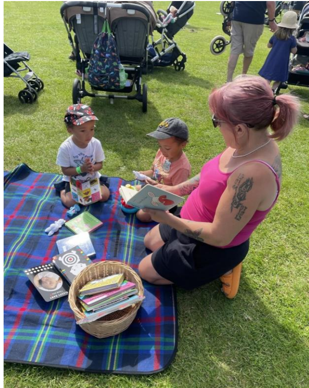
3 - Peterborough Early Years SEND Specialist and Portage Service team Summer family days