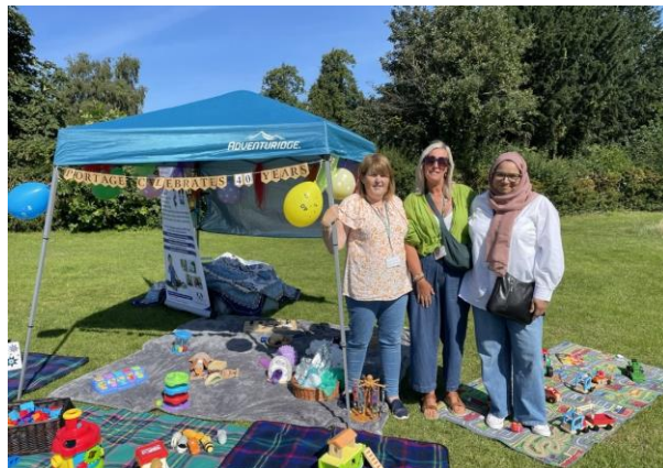
4 - Peterborough Early Years SEND Specialist and Portage Service team Summer family days