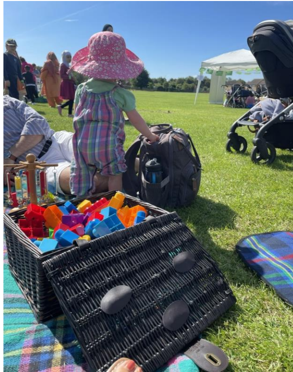
5 - Peterborough Early Years SEND Specialist and Portage Service team Summer family days